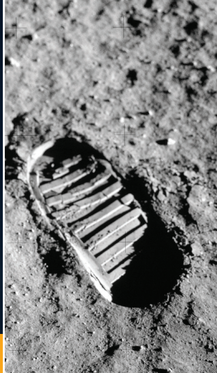
There is no rain or wind on the Moon, so Neil Armstrong's footprint could remain there for millions of years.

WHEN THE LUNAR LANDER TOUCHED DOWN ON THE MOON, IT MARKED THE END OF THE SPACE RACE. Wernher von Braun's Apollo design had won it for the Americans. Now, over half a billion TV viewers on Earth were united in admiration as astronaut Neil Armstrong climbed down the Lunar Lander's ladder onto the Moon's surface. "That's one small step for man," Armstrong told the world from his radio microphone, "and one giant leap for mankind".