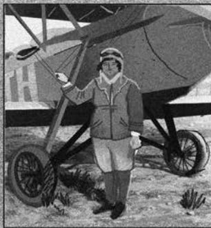
PILOTS PREPARING FOR RACE

prepares for Coronation celebrations. Preparations are well on the way as the entire capital are gearing up for the grand day in our Royal history. Gladis May Berkshop of East Clapham speaks of the excitement. We're planning a street party with lots of cake & songs we're all very much looking forward to celebrating our new King. Continues p5.