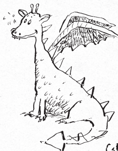
The Common or Garden or Basic Brown

The Common or Garden and the Basic Brown are so similar that they can be dealt with together. These are the most familiar breeds - the ones we