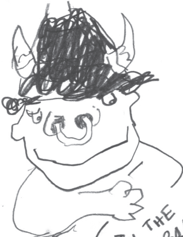
DOGSBREATH THE DUHRAIN