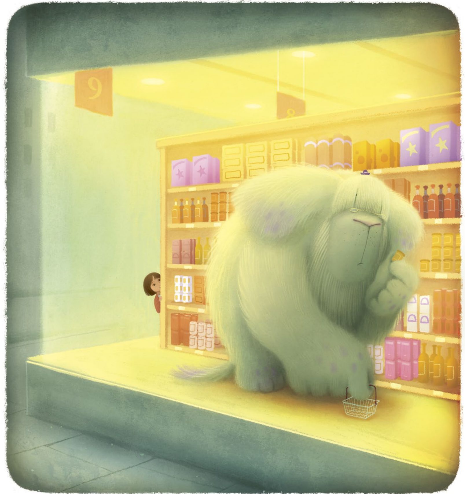
Sometimes, I see him at the shops. I don't think he has any friends.