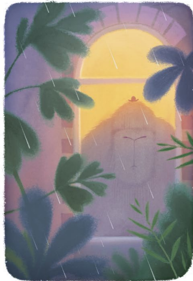
Sometimes, I see the Thing in his front room.