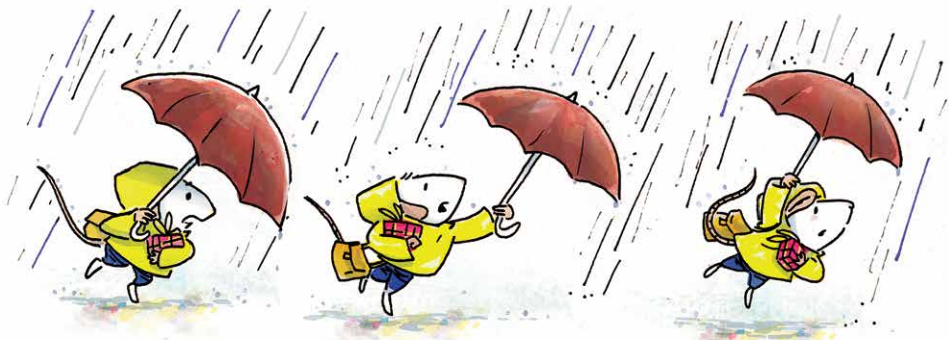
Hold on tight, Mouse.