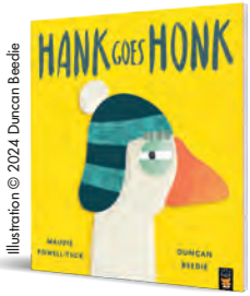
Illustration © 2024 Duncan Beedle

Can you find 6 differences between the pictures of Hank and friends below?